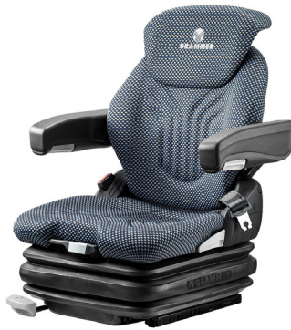
PRIMO® XL Comfort seat for forklifts and compact construction machines

Despite its low-profile structure, the PRIMO® XXL offers maximum suspension stroke, which, in conjunction with low-frequency technology, ensures very good damping properties. The pneumatic weight adjustment, which can be operated at the push of a button, allows the correct driver weight to be set quickly and easily, an especially important factor with frequent driver changes. Additional driving comfort is assured with the ergonomic seat upholstery and an extra-long backrest fitted with mechanical lumbar support. The PRIMO® XXL is equipped with a duosensitive ELR-belt system and an operator presence switch as standard.