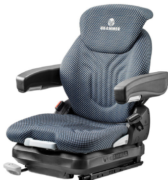
PRIMO® XM For small forklifts and compact construction machinery

With an ergonomic seat cushion, an extended backrest, lumbar support and 80 mm suspension stroke, the PRIMO® XXM combines a compact design with plenty of comfort and good support for the spine. The seat features a smooth-running adjustment lever that allows drivers to easily set their weight within a range of 45 to 170 kg. This is a clear advantage with frequent driver changes, as it allows even inexperienced users to adjust the seat's suspension response quickly and intuitively. The PRIMO® XXM comes equipped with a duosensitive ELR-belt system and an operator presence switch as standard.