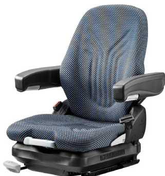
PRIMO® XXM For reach trucks and compact construction machinery

Our standard seats with mechanical suspension.