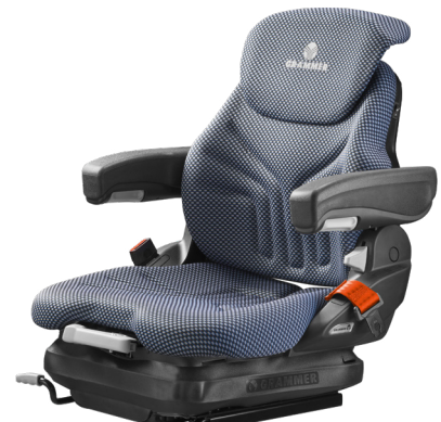
PRIMO® XM PLUS Standard seat with mechanical suspension

The PRIMO® L PLUS pampers the driver with a seat that is 50 mm wider (compared to the PRIMO® L). Running on 12 or 24 V, the pneumatic suspension with reduced suspension stroke minimizes vibrations effectively even in the smallest cabs. The driver's weight is adjusted by means of an ergonomically mounted push button. A visual indicator helps the driver to find the optimum setting. The seat meets the latest safety requirements and comes with seat and belt contact switches and a duosensitive ELR-belt system with orange belt as standard equipment.