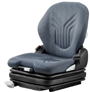
PRIMO® L Standard seat for forklifts and compact construction machinery

The PRIMO® XL is equipped with low-profile, low-frequency suspension that runs on either 12 or 24 volts for excellent driving comfort. The driver's weight can be easily adjusted from 45 to 170 kg at the touch of a button using the pneumatic suspension. The comfortably shaped seat top and the lumbar support can be adjusted to match the driver's individual needs to optimum effect, ensuring top workplace ergonomics at all times. The PRIMO® XL is equipped with a duosensitive ELR-belt system and an operator presence switch as standard.