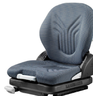
PRIMO® M For small forklifts

The PRIMO® XM PLUS features low-profile mechanical suspension with 80 mm suspension stroke. The comfortable seat top with a seat cushion width of 470 mm and mechanical lumbar support facilitates safe and ergonomic sitting at all times. With this model, the driver's weight is adjusted quickly and simply via a readily accessible ratchet function. The PRIMO® XM comes equipped with a duosensitive ELR-belt system and an operator presence switch as standard.