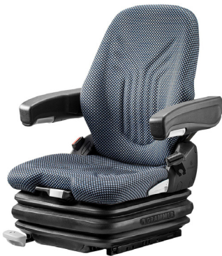
PRIMO® XXL Comfort seat for reach trucks and compact construction machines

Our PRIMO® models with pneumatic suspension.