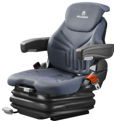
PRIMO® XL PLUS Comfort seat with pneumatic suspension

The PRIMO® PLUS models with extra-wide cushions and seat tops.